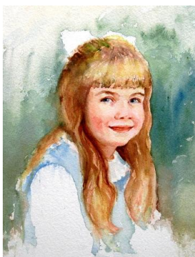
Demo of Betsey.

Tuition per Workshop, $100. Minimum to open each Workshop—6.